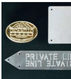
Virtually any shape can be used.

See back side of this sheet for a partial listing of most commonly ordered Consecutively Numbered Tag sizes. Lead times vary according to complexity and quantity. Custom and Consecutively Numbered Tags are not returnable.