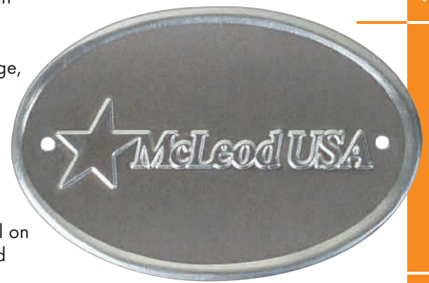
Custom Aluminum Oval

to produce just the right marker for your particular application. If you don't see what you need in our catalog, please feel free to consult our factory at 800-328-0194 for a quote.