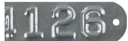
Consecutive numbering provides an accurate economical solution to asset marking needs.