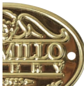
High quality embossing showcases your company identity.