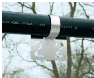
Custom design capabilities at Premax provide countless special application solutions.